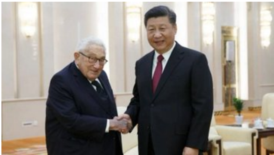
Xi Jinping and his handler: (Jew) Henry Kissinger

The fingers should be pointed at the Jews!